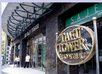
EGI Taft Tower