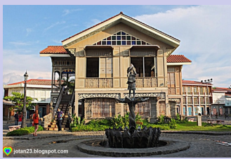
Las Casas Bataan