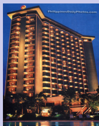
Century Park Hotel